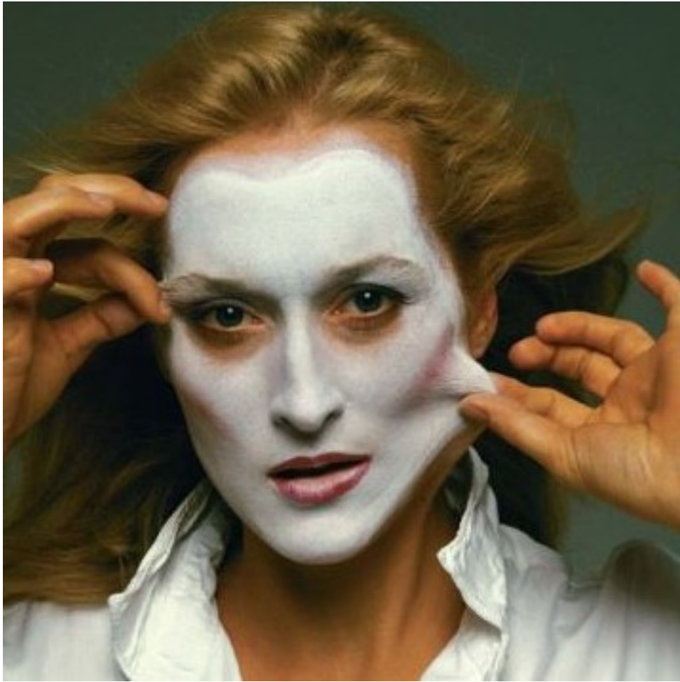
Below: Annie Leibovitz, "Meryl Streep" (detail)