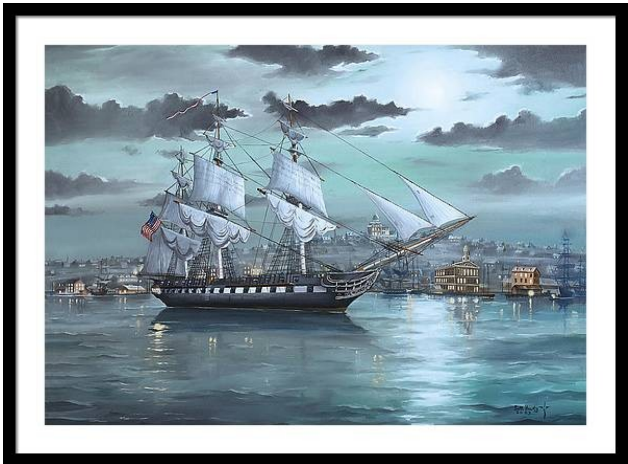
USS Constitution – Old Ironsides in Boston harbor